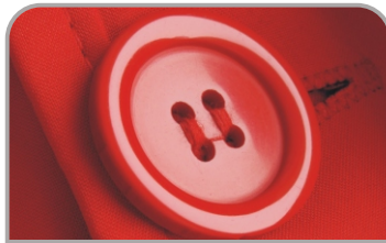
Sewing on buttons